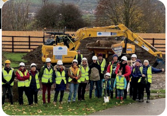
Clockwise from above: Early design meeting with Oakworth team; View of the build (July 2023); Breaking ground ceremony (Dec 2022); Common House main room (July 2023)