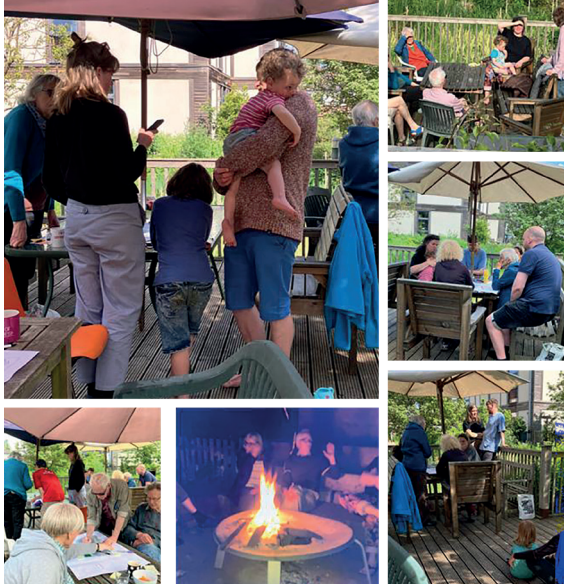
Residential weekend at LILAC Leeds cohousing May 2023 - a taster of community living for 5R

Our long-standing intention to create a diverse and multi-generational community, enjoying and promoting a more sustainable and neighbourly way to live, is well underway!