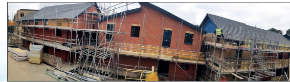
The site in July 2023

A Five Rivers member and long-time local resident