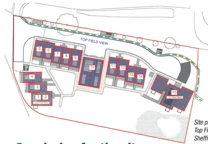
Site plan: 1 to 15 Top Field View, Sheffield